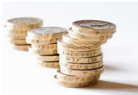
make a donation