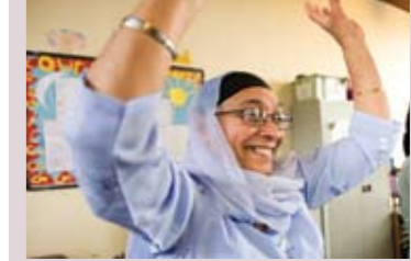
Left: Challenging Arthritis in Walsall