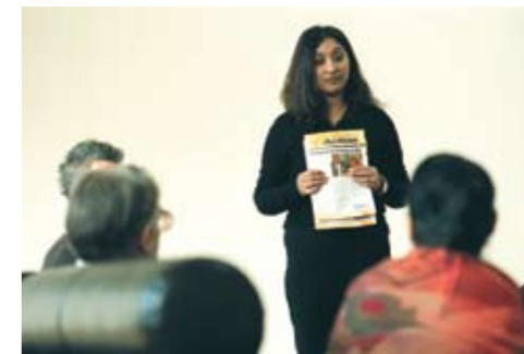
training and support