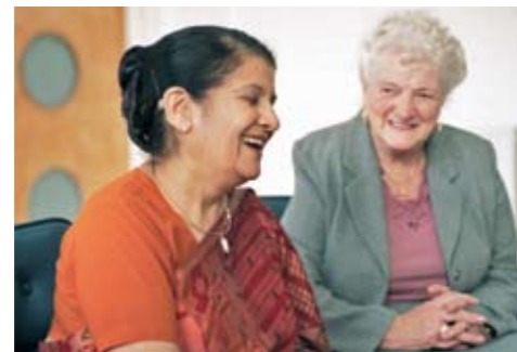
become a member